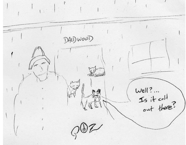
-submitted by Forest Walker